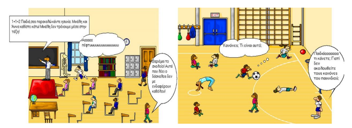
Figure 1. Indicative scenes from the first part of a story

The same procedure was followed during the second part of the stories; students were asked to imagine their classes without problems and a right behavior was assigned to a character (Figure 2). In case students wanted to portray something else, teachers obeyed their will but reinstated the matter to a following scene. All students were encouraged to participate, but participated as much as they wanted and all had the same chances to contribute to the development of the stories.