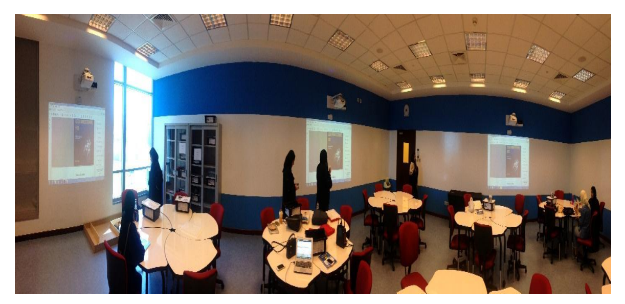
Figure 2. An ALPs Classroom

The third subsystem is a state of art classroom environment named Active Learning Programs (ALPs). Equipped with interchangeable tables, the ALPs provide a suitable setup for teamwork or individual activity and the kind of cooperative learning modes appropriate for engineering students. All-round writable walls allow students to perform presentations using a variety of media such as posters or whiteboards as well as work on documentation. As shown in Figure 3, each ALPs classroom is equipped with five interactive and high definition projectors which can be uniquely allocated to each team. This facilities activities such as screen-written annotations, teachers' notes and real-time review of documentation as well as cross-team sharing.