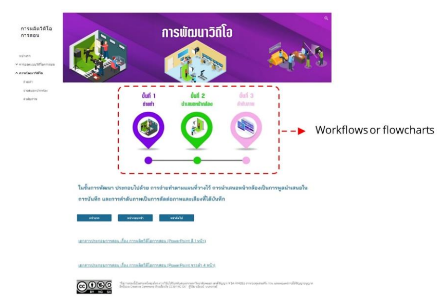
Figure 1. Steps in the process or order of content (https://sites.google.com/view/instruction-videoproduction/การพฒนาวดโอ)

Visual graphics are designed to show the steps and how they are connected. Summaries of content make it easier for pre-service teachers to learn and follow as they create their own instructional videos. Pre-service teachers can also evaluate their knowledge and ability as they learn each topic. As shown in Figure 1 , the text blinks to show where pre-service are learning in the lesson.