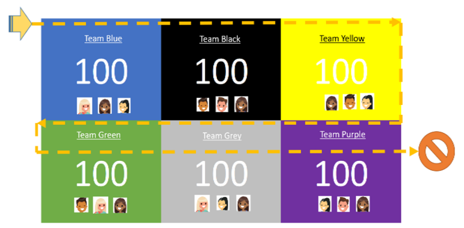
Figure 1. Starting stage of CrossQuestion game