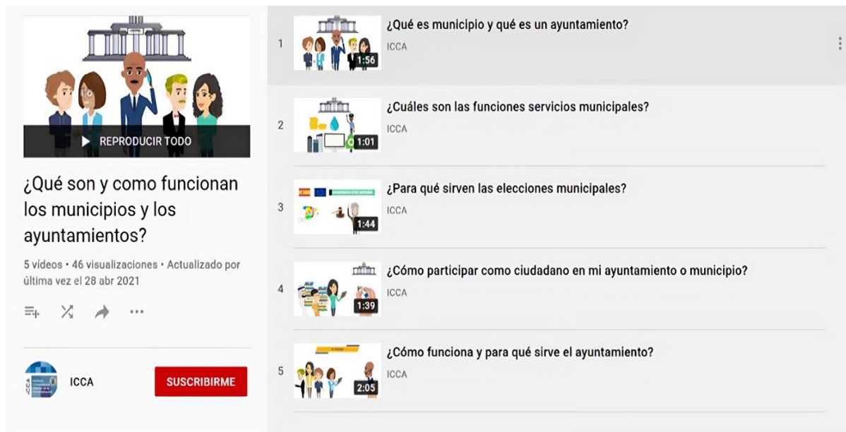
Figure 3. Images of links to five videos on YouTube (in Spanish)