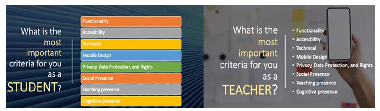
Figure 5. On-campus session number 3: Slides to introduce the questions for intra-team reflections