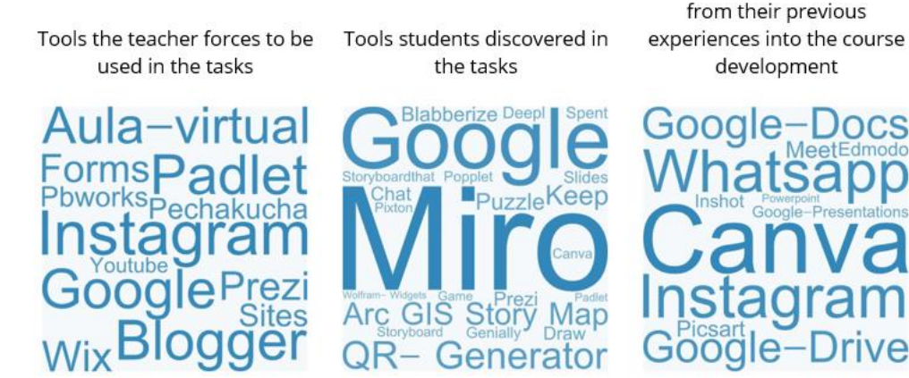
Figure 1. Comparison of mandatory, discovered and already in use tools mentioned by students as key

presenting information ("These apps, make us organize the work properly in order to classify the contents we work on and they make us learn about technology and several ways to complete the activities", team 5).