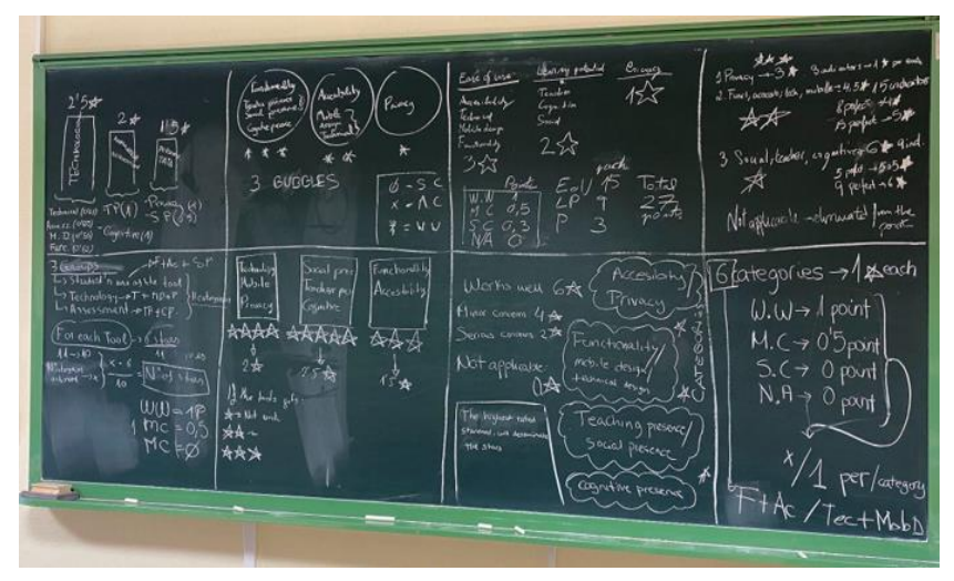
Figure 7. On-campus session number 4: Teams' mechanisms to rate tools

After sharing the key aspects of each of the rating mechanisms, the students and the professor reflected upon the challenges of rating tools for teaching efficiently, how those mechanisms could be useful in real schools, and how each mechanism mirrors values and beliefs about teaching, learning and education from each one of the team members (Figure 7).