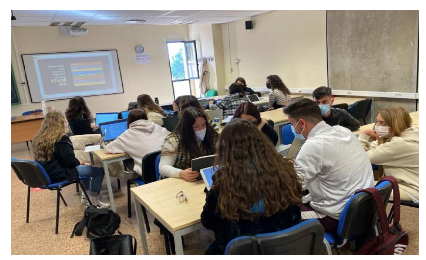
Figure 2. On-campus session number 3: Team's discussion